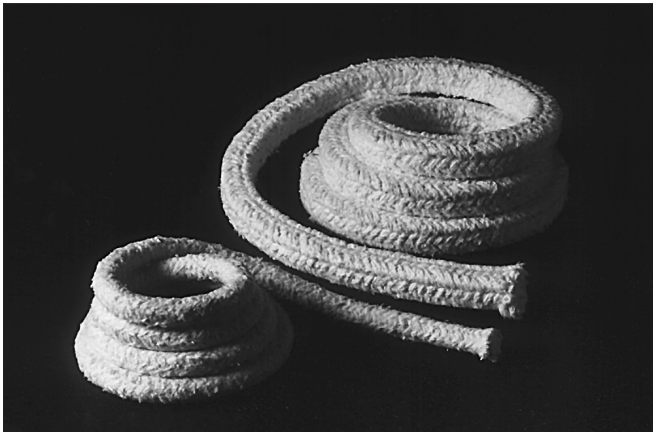
Fiberfrax Round and Square Braid